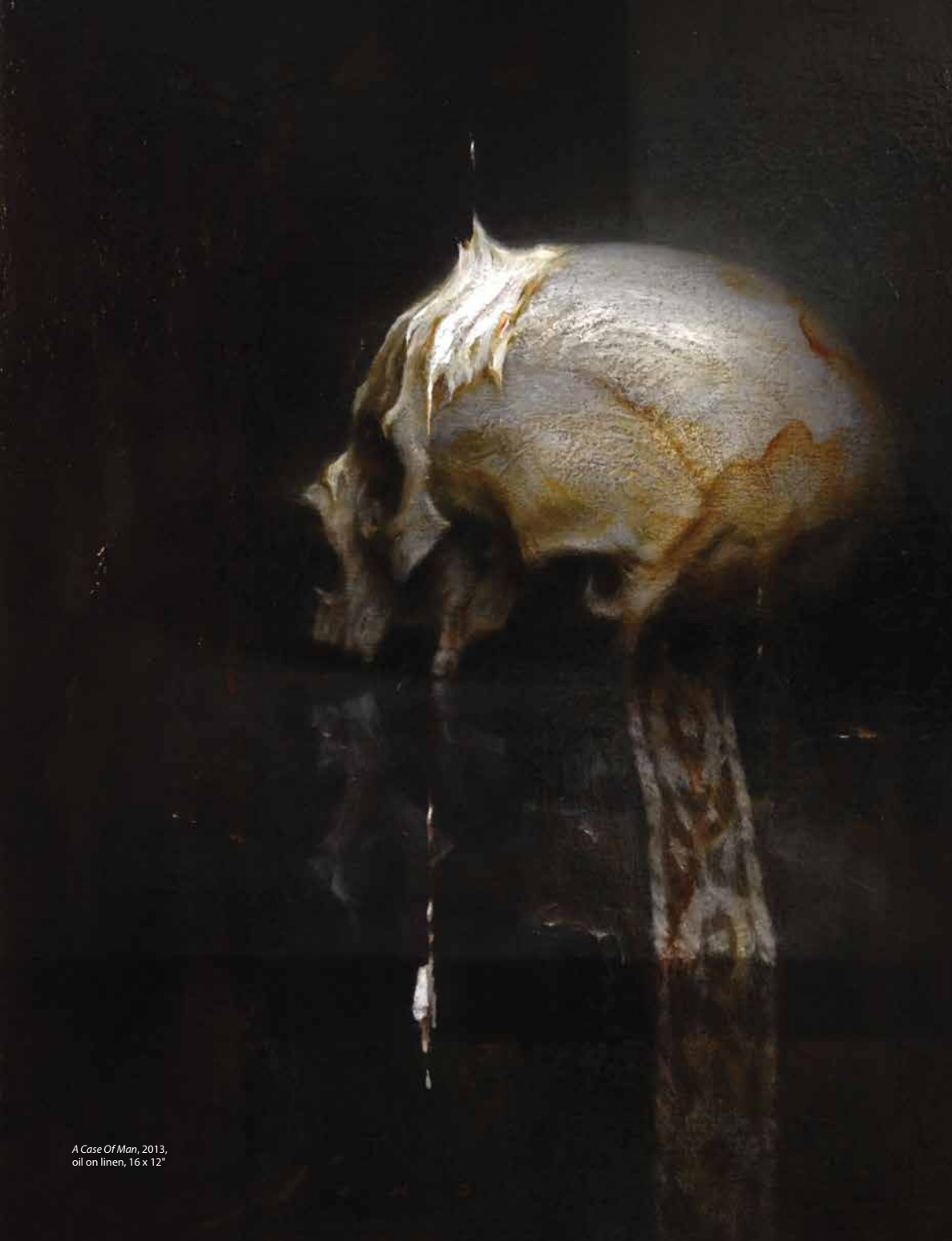
A Case Of Man , 2013, oil on linen, 16 x 12"