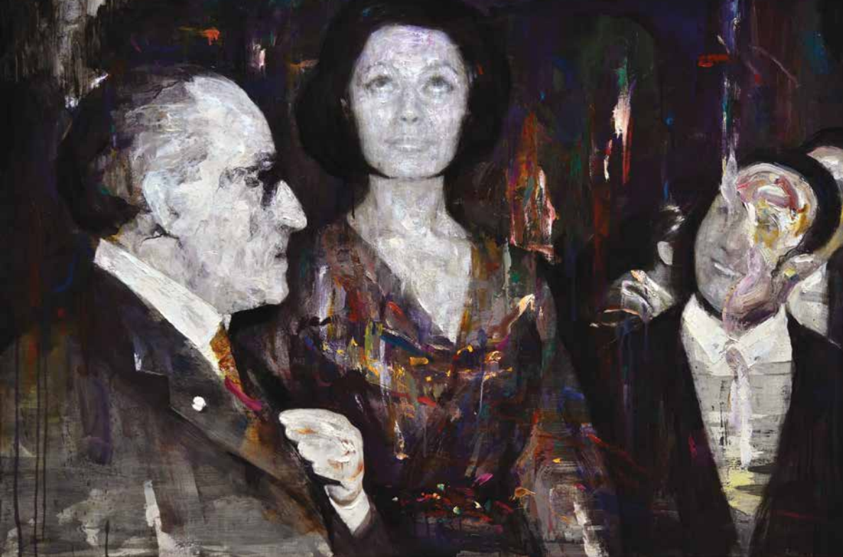
Show Business , 2014, oil on linen, 32 x 48"