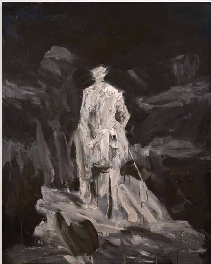
Untitled , 2019, oil on linen, 60 x 48"