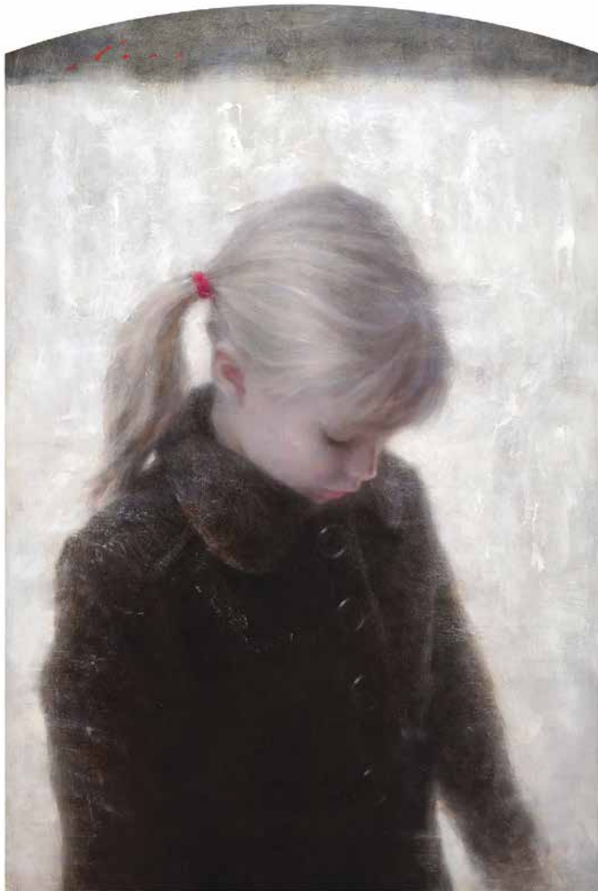
Harper In Snow, 2014, oil on linen, 30 x 20"

increasingly open to both subject and technique. He feels a sense of conviction to explore the integral role of art-making in society as well as the materiality of the painting process. "My multicultural backgrounds framed up tough questions on identity and values, defined by the different systems I was raised and later educated in. My current creative process confronts some of these dichotomies from a spiritual as well as technical standpoint. I don't know if absolute freedom can be obtained in art making, but it's a strong quest to find the harmony of it in my current creative process," he says.