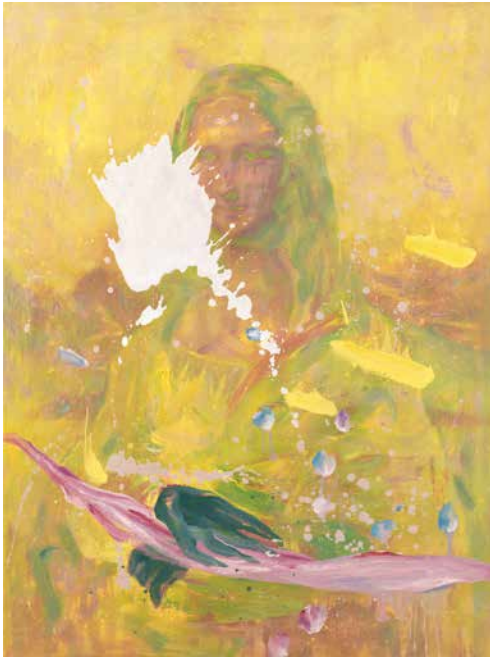
Mc2, 2022, oil on linen, 48 x 36"