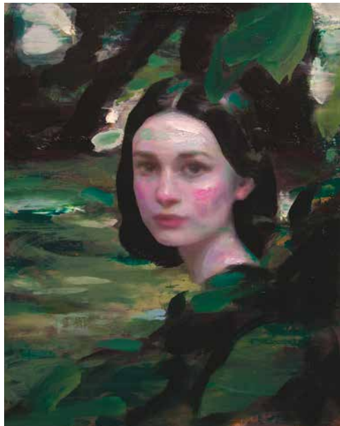
Jewel , 2018, oil on linen, 18 x 14"